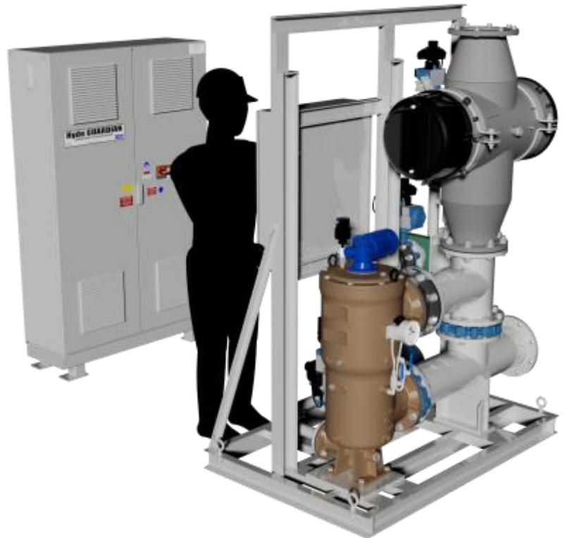
The HG300GS assembly mounts major components providing the most compact solution available.